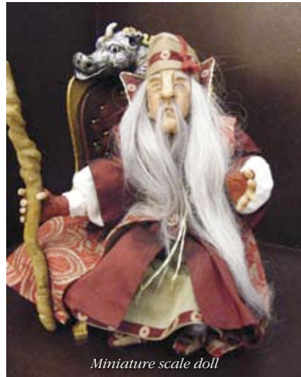
Miniature scale doll