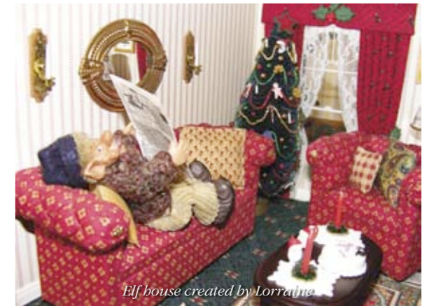
Elf house created by Lorraine