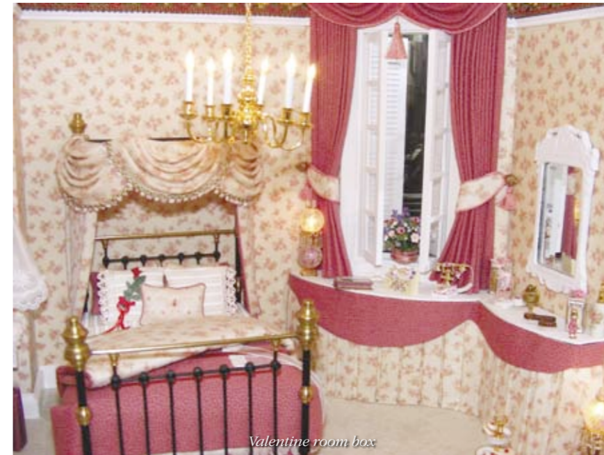
Valentine room box